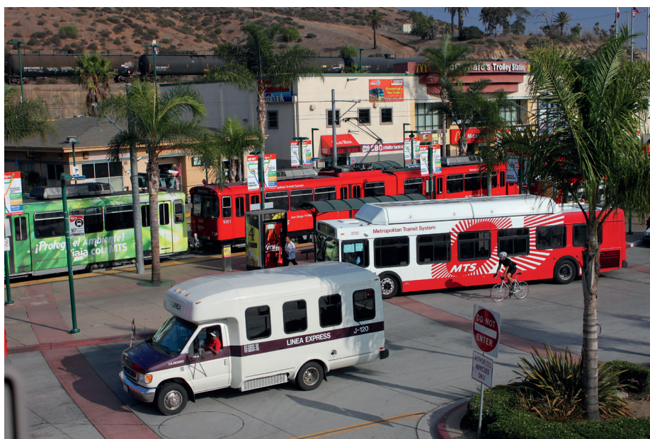
San Diego Metropolitan Transit System.

ToD can improve the efficiency, cost effectiveness and sustainability of the transport network overall