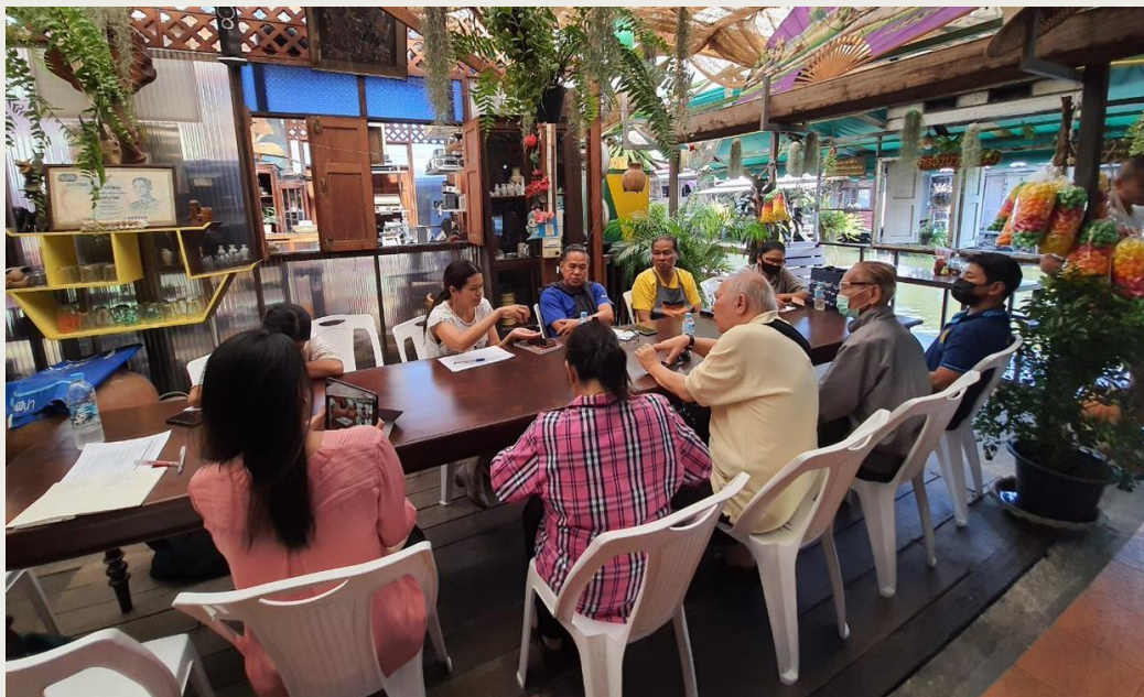
Bangkok TODP Stakeholder Engagement