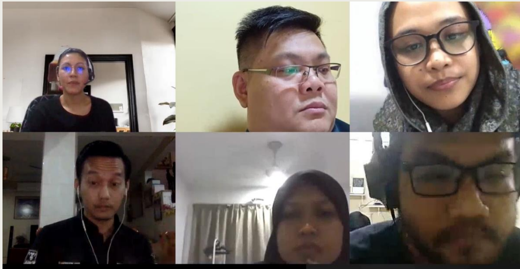
House Travel Survey Focus Group Virtual Discussion

With the gathered input from a variety of stakeholders, updates and enhancement to the HTS application will be incorporated before the full release in February 2021.