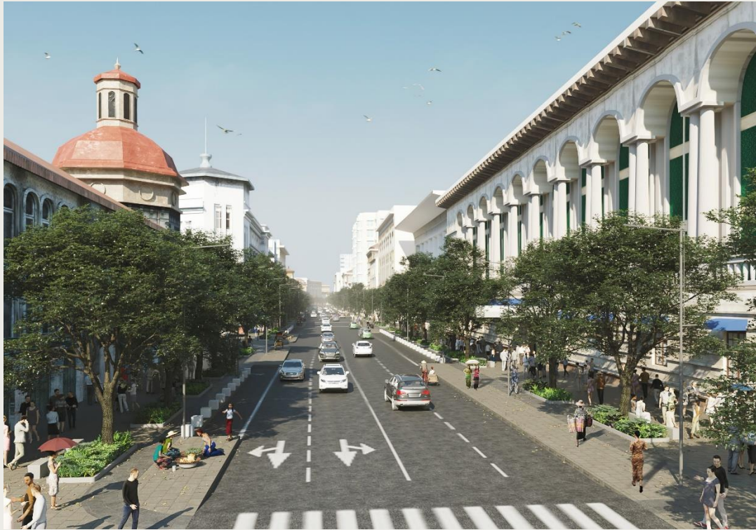
Artist's impression: One of the improved pilot streets in downtown Yangon