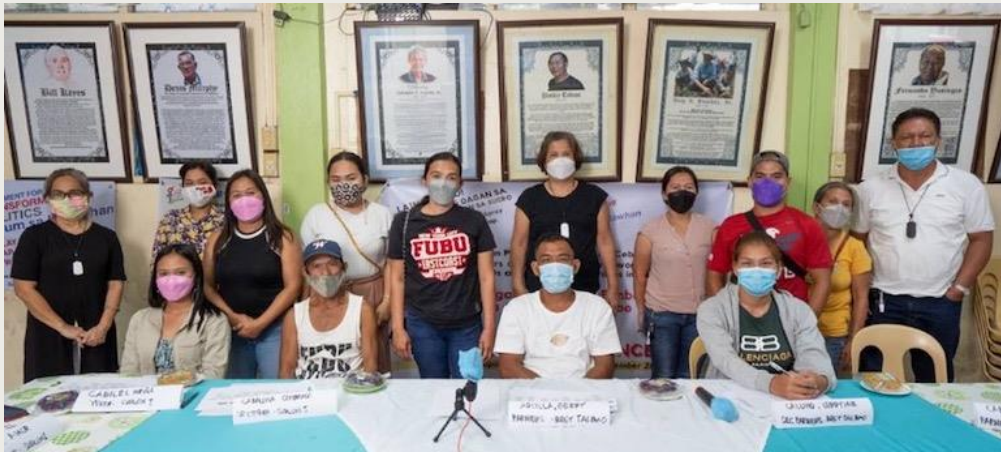
In Cebu, consultations were allowed to be held in person, ensuring a deeper level of engagement

The Global Future Cities Project Philippines delivery team provided spaces that allowed the voices of different community groups to be heard. A hybrid face-to-face/virtual approach was utilised while firmly observing health protocols. Transportation was provided to participants. The elderly, the youth, people with disabilities and indigenous people were invited, present, and active in the consultations, and 53% of participants were women.