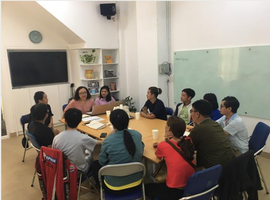
In-person focus group consultations were held to understand better the situation of vulnerable groups

However, it also revealed barriers to accessibility to public transport, some of which may be improved by applying an interoperable city-wide STS and a more sophisticated fare policy that would not be possible without the technologies and business processes that underpin STS.