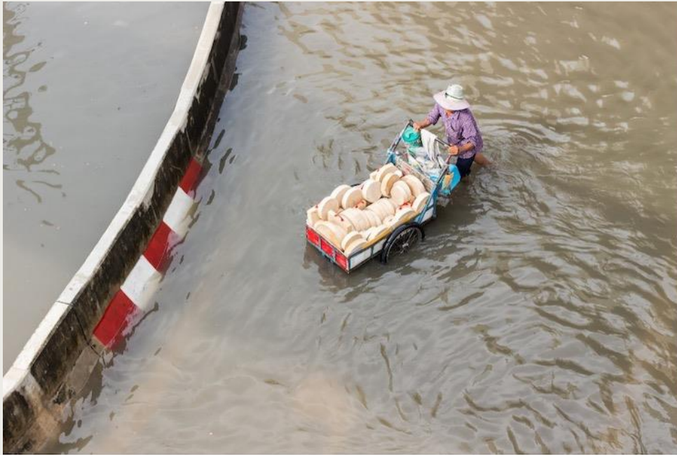
Climate Change has resulted in increased flood risks due to higher intensity rainfall, negatively impacting the livelihoods of vulnerable groups.

The Bangkok Decision Support System (DSS) for flood management engages with Bangkok Metropolitan Administration (BMA) to increase the city's ability to undertake planning for flood risk management as well as improve the existing rainfall forecasting system, also being enhanced by additional calibration of their existing rainfall radars to provide more accurate rainfall forecasts.