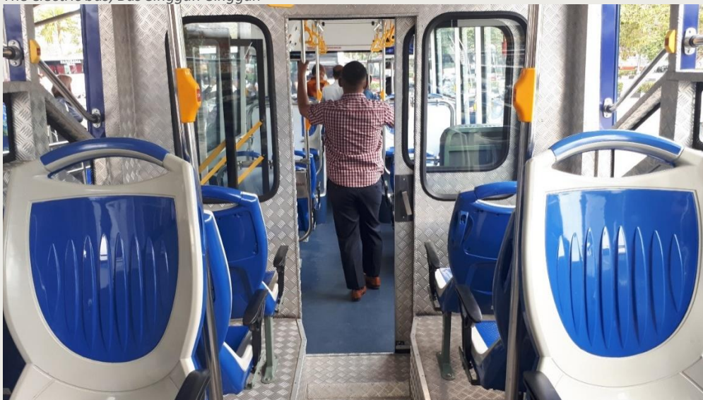
The interior of the electric bus, Bas Singgah-Singgah