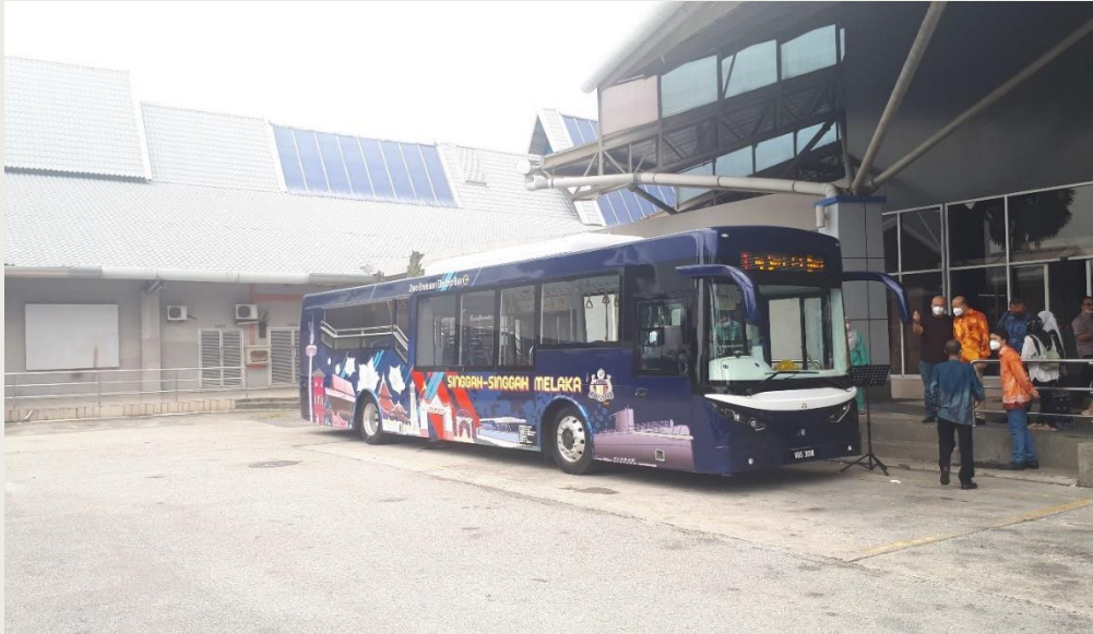
The electric bus, Bas Singgah-Singgah

usage of private motorised vehicles, especially when travelling to tourist attractions within the Heritage Area.